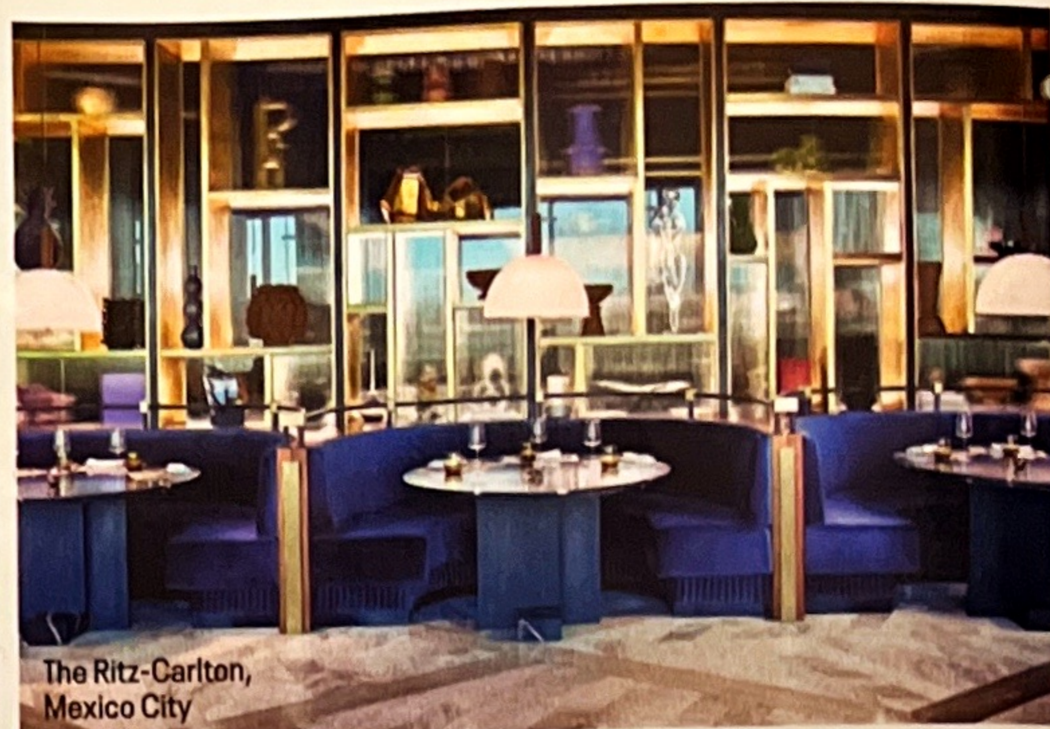
The Ritz-Carlton, Mexico City

the hotel's Carlotta Reforma Sky Bar, for the views and the scene. (Afterward, fly to the Ritz-Carlton in NYC's Nomad neighborhood; the rooftop bar has become the place to be at the top of the world.)