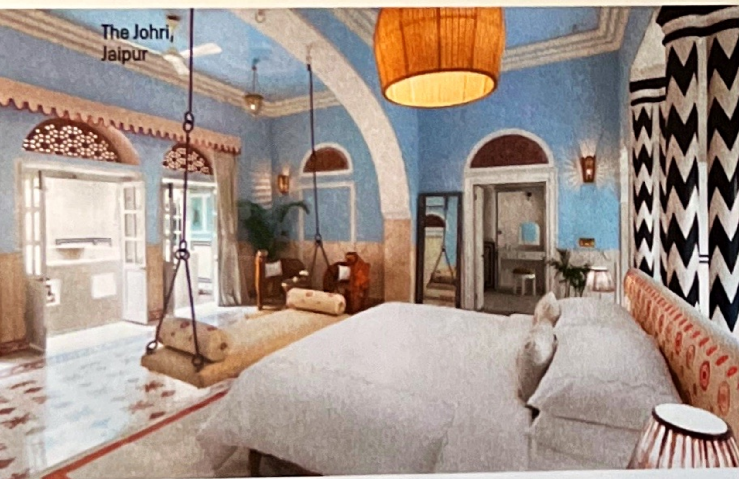
The Johri, Jaipur

Oberoi, Marrakech It's a trick for a hotel in such a historic city to be both traditional and contemporary, grand and simple. But the Oberoi, 10 years in the making, ➔