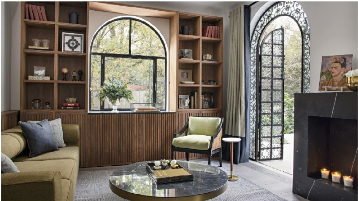
The library has an all-day honor bar.