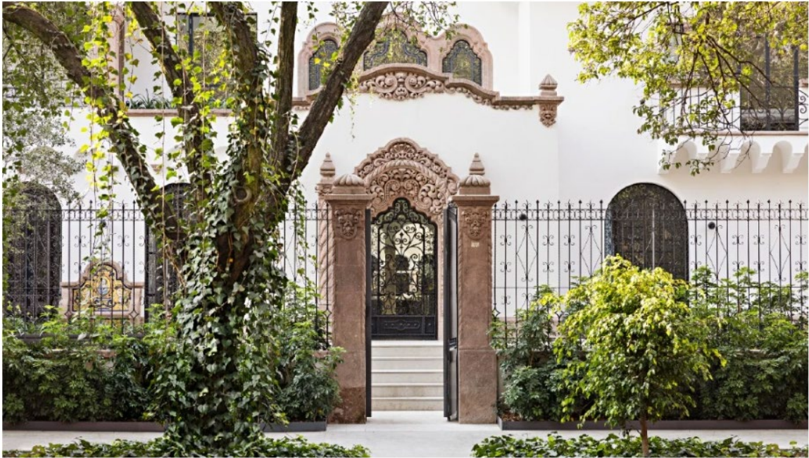
The facade of the historic mansion Casa Polanco