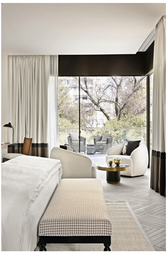
Casa Polanco's Lincoln Park Suite Karyn Millet